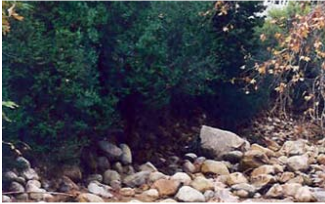
Figure 7-8 Subsurface layer exposed after removal of three cobbles from the armour layer