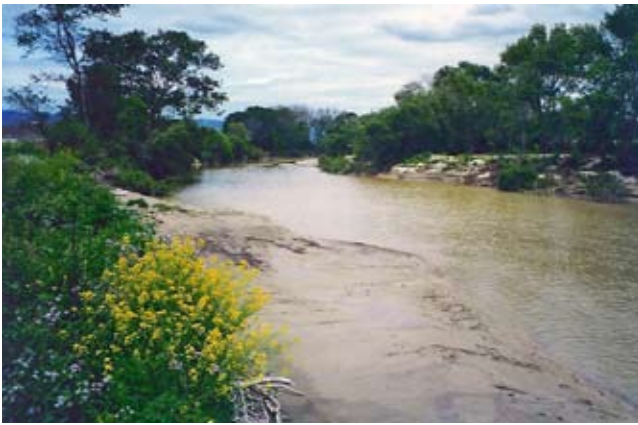
Figure 7-5 Sand and gravel-bed alluvial channel