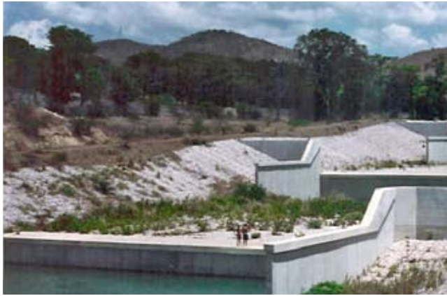
Figure 7-2 Grass-lined threshold channel