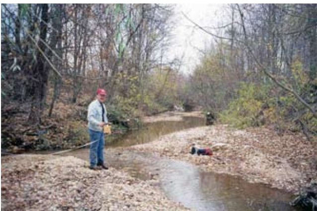
Figure 7-6 Gravel-bed alluvial channel