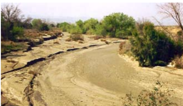
Figure 7–10 Remnant terraces in an ephemeral stream from previous high-flow events

a remnant of the last major flow event, rather than a theoretical channel-forming discharge (fig. 7–10). In addition, in ephemeral streams, sediment transport most often occurs as a response to infrequent and flashy hydrologic events. These events cause temporal and spatial episodes of aggradation and degradation and a significantly variable sediment yield. Channel reaches under such flow conditions can be out of phase, and this episodic behavior suggests that ephemeral stream channels may be inherently unstable. Thus, the channel-forming discharge concept may not be applicable.