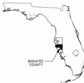
Figure 1 – Location of Manatee County, Florida within the Florida West Coast Resource Conservation and Development (RC&D) Area

The Florida West Coast RC&D Council is a local U.S. Department of Agriculture sponsored 501(c)(3) organization specializing in community leadership capacity building in the areas of sustainable economic and community development, natural resources use and conservation, sustainable agriculture, and healthy community food systems. The RC&D Area (Figure 1), authorized by the Secretary of Agriculture in 2001 includes Hillsborough, Manatee, Pinellas and Sarasota Counties, on the central southwest coast of Florida, serving a population of approximately 3 million people (Community Survey of the U.S. Census Bureau, 2003).