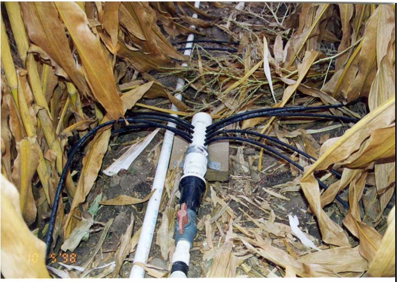
Figure 2. Flow divider used to supply water to 9 individual furrow basins for the purpose of simulating LEPA sprinkler irrigation.

The SDI system was disconnected for the plots associated LEPA treatments during the season to prevent any water application by SDI. The simulated LEPA treatments were accomplished by setting up a surface PVC pipe down the 81 ft length with pressure regulated flow dividers for each 30 ft increment. Each flow divider (Figure 2) had 9 equal length supply tubes (0.25 inches ID) delivering water to 9 individual furrow basins. Furrow basins were approximately 9 ft in length and were constructed in the furrows. The amount of water necessary to apply the one-inch application to the LEPA plots was calculated from the number of flow dividers and supply tubes in relation to the land area covered (3 flow dividers with 9 tubes each covering 81 ft of plots and 15 ft of width [3 furrow basins]). The application rate of the simulated LEPA irrigation treatments was approximately 1.5 in/hour which would nearly match the application rate of typical LEPA irrigation in the region. Furrow basins were used to retain applied water until it could infiltrate into the soil. Furrow basins are an integral part of the LEPA system and practices.