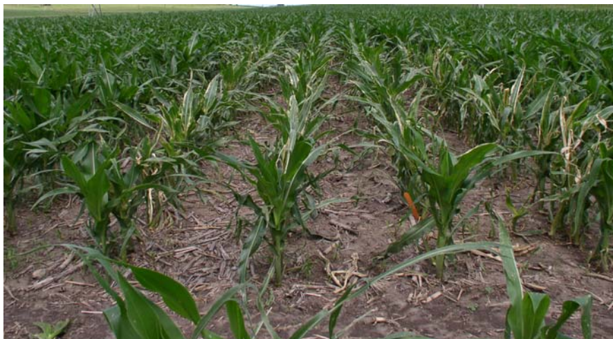
Figure 4. Plant damage to corn at the V8 stage following application of liquid swine manure with an EC of 20.3 in 2003.

Corn growth was less affected than soybean, and damage was detected only with the V8 application at the 20.3 dS m -1 concentration (Figure 4 & Table 3). The V14 application caused even less damage, likely due to salt tolerance of the fully developed cuticle on the corn leaves. The V8 application of 20.3 dS m -1 concentration caused some stunting of plants but no plant death. Overall, the manure increased the corn yields when applied at V14 (178 bu/ac) compared to V8 (165 bu/ac).