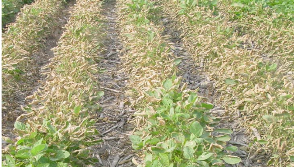
Figure 3. Plant damage to soybean caused by a single application of liquid swine manure with a EC of 20.3 at the R1 growth stage.