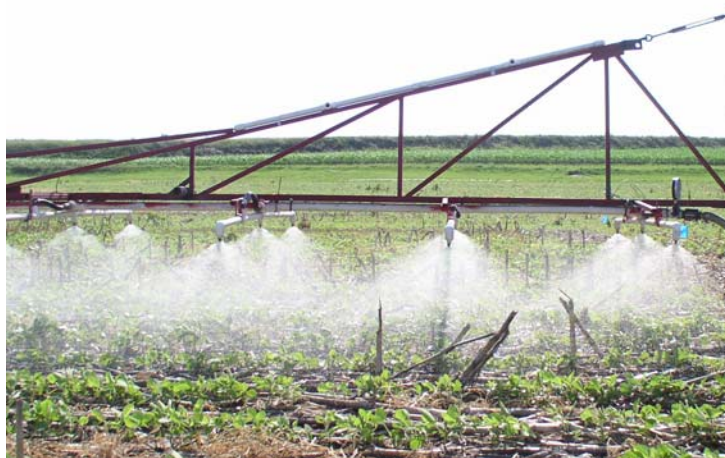
Figure 2. Applicator used to apply liquid swine manure to corn and soybean.

1 Mean EC levels for the fresh water used as a control treatment and liquid manure dilutions applied to corn and soybean.