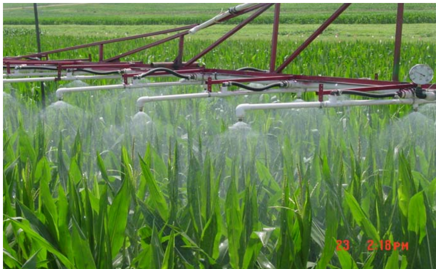
Figure 2. Applicator used to apply liquid swine manure to corn and soybean.

growth stages of corn and soybean. The first application was applied on July 2 when corn was at the V7 growth stage and soybean was in the V3 stage (Ritchie, et al., 1996; Ritchie and Hanway, 1984). Air temperatures during application were in the upper 80's. The second application was applied on July 24 when corn was at the V14 stage and soybean was at the R1 stage. Air temperatures during application were again in the upper 80's. Approximately 0.5 inches of liquid manure was applied over a 10-minute period to corn and soybeans at each EC level.