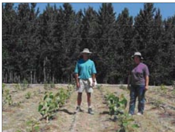
Figure 1. Two-month-old hybrid poplars grown from 8-inch cuttings (foreground) and 7-year-old hybrid poplars (background).