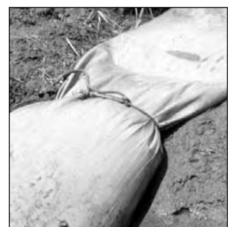
Choke rope on tubing