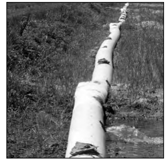
Tubing in field

In many installations it may be advisable to size down to the next smaller size tubing after covering a significant amount of the field. An example would be to start with 15-inch tubing for a 2,000 gpm flow but go to 12-inch once half of the field has been covered and the flow is probably 1,000 gpm or less. When the flow in the tubing doesn't keep it rounded, gates and/or holes may not flow fully and the tubing may flap enough to cause it to tear. The flapping is more likely to be a problem on steeper fields and on the downslope side of levees. Proper-sized tubing can help reduce this problem but it may be necessary to use rope or strapping to restrict the tubing at a point below where it continues to flap against itself.