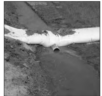
Culvert pipe under tubing