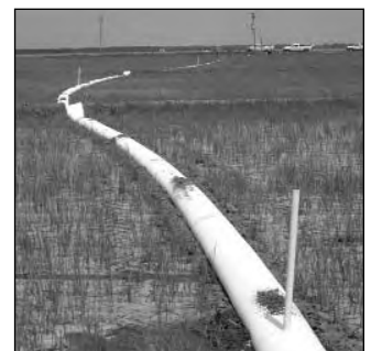
PVC pipe in tubing