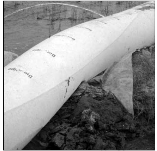
Air pocket in tubing

Adjustable 2.5-inch diameter slide gates and/or holes are placed in the tubing for water inlets to each levee that the tubing crosses. Gates and/or holes should be placed near the topside of the tubing at 11 or 1 o'clock position. They can be placed anywhere between the levees but when placed closer to the upper levee, the tubing will hold more water when not irrigating and be less likely to float or move. The holes or gates are adjusted when flooding the field so that each levee floods up at about the same rate. Most growers find that after the initial adjustments they don't have to spend as much time with the water management as they do with most fields that are flooded conventionally. Additional adjustments during the season may be necessary if the flow to the field changes significantly as is possible with pipeline systems that have several wells and multiple pumping outlets. It is important that small relief holes be punched in air pockets that form in the tubing. Air pockets restrict the water flow through the tubing and can become a hot spot where the tubing may stretch, become thin, and possibly rupture.