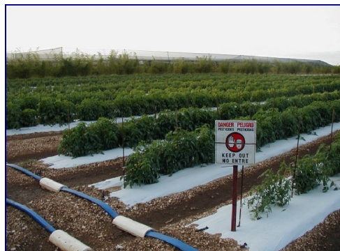
Figure 2. Application of the QIC prototype to automatic soil moisture based irrigation of tomatoes at UF Tropical Research and Education in Homestead, FL.

to switching tensiometers (both in bypass mode) by reducing irrigation water by 70% on drip irrigated tomato in South Florida (Fig. 2).