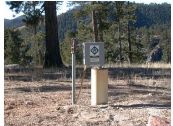
Rural domestic well in the foothills.

Ground water is found in formations called aquifers that occur throughout the state. An aquifer is a geologic formation made up of porous material such as sand, gravel, and unconsolidated rocks. It may also consist of spaces or fractures between subterranean rocks that are saturated with water. Aquifers may be as shallow as a few feet, or as deep as thousands of feet below the ground surface. Wells in mountainous areas of the Front Range typically average 350 feet deep; while in eastern Colorado, over the Ogallala aquifer, they average less than 300 feet deep. Ground water originates as precipitation that moves downward from the earth's surface until it reaches the water-saturated zone and becomes ground water. Aquifers may spread hundreds of miles or may be in small, localized areas. Alluvial or tributary ground water moves through the aquifer, where it eventually joins a surface stream. Other aquifers are classified as non-tributary because the ground water neither contributes to, nor draws from, a natural stream.