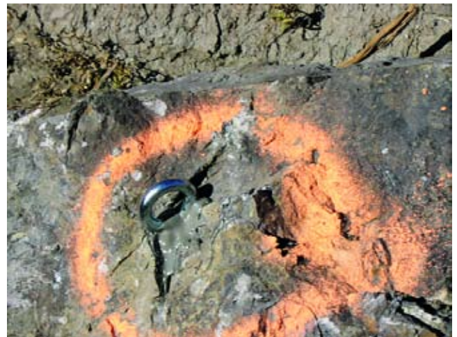
Figure TS14E-10 Wire rope anchored in boulder with epoxy