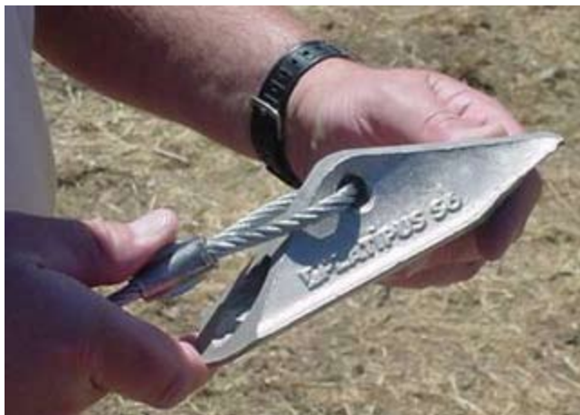
Figure TS14E-1 Platipus Stealth ® anchor