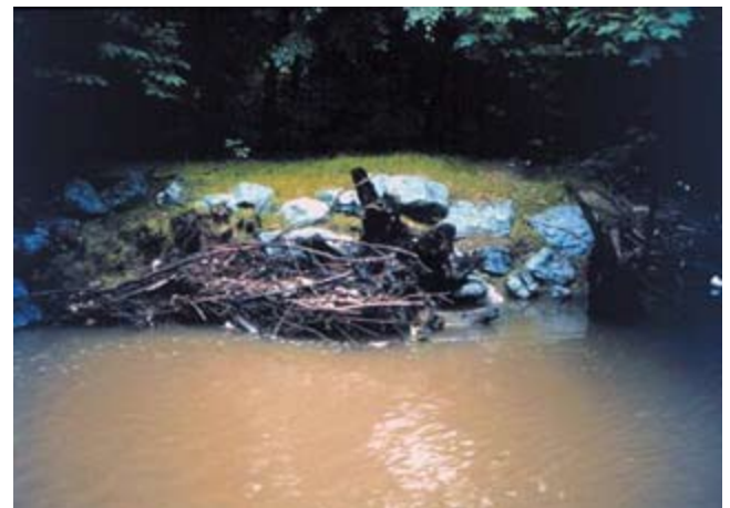
Figure TS14E-13 Debris lodged against rootwads

This factor is figured by estimating the percentage of voids in the surface area that are not anticipated to plug/fill with debris. Use conservative judgments when making this estimate. If method 1 is used to calculate the surface area, the permeability coefficient (K) is 1.0.